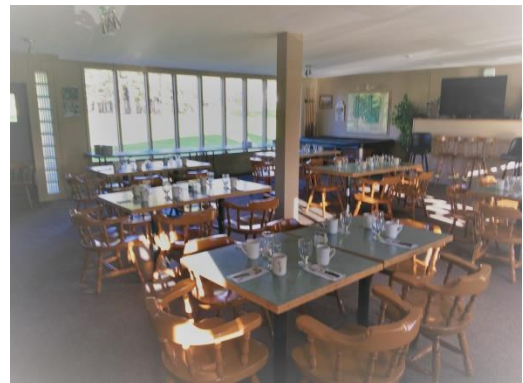
Tables of 5